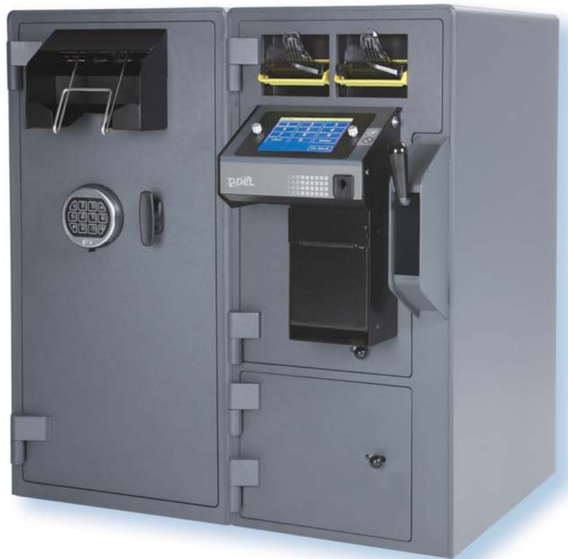
Shown with dual note validator (single available)