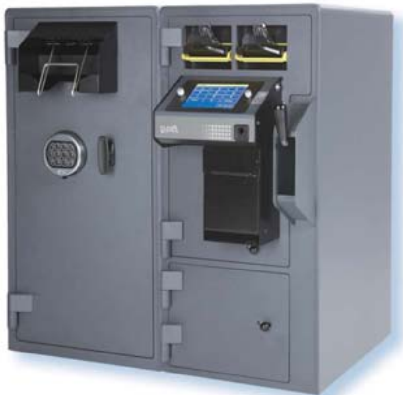
Shown with dual note validator (single available)