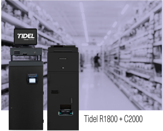
Tidel R1800 + C2000

Tidel back office cash recyclers are designed for unparalleled performance and adaptability to support a wide range of cash management requirements. Our approach helps retailers rapidly respond to evolving cash handling requirements while simplifying operations and reducing store overhead. Our portfolio enables mix and match flexibility when combining note and coin