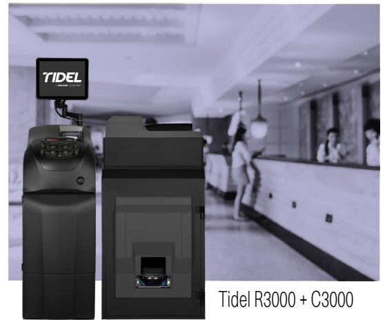
Tidel R3000 + C3000

recyclers, and enables retailers to make the best use of the automation, capacity, and speed they may need to address their current cash volume requirements.