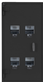
Rolled Coin Dispenser