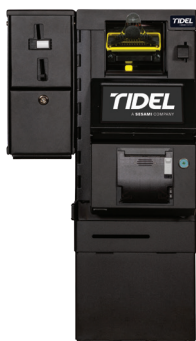
Tidel D3 Bulk Note Feed Single Coin Acceptor