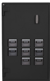
Bulk Coin Dispenser 6 cup and 8 cup