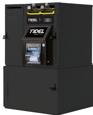
Till Storage Vault