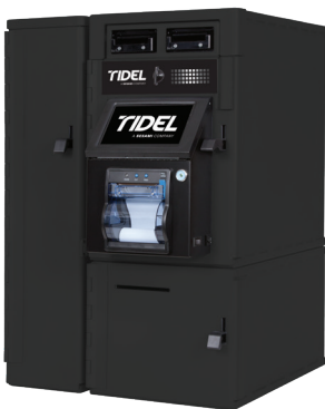
Narrow Side Vault