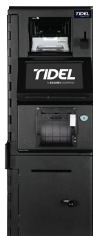
Tidel D3 Single Note Feed Storage Vault