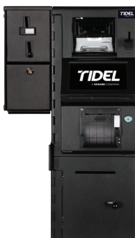
Tidel D3 Single Note Feed Storage Vault Single Coin Acceptor