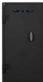
High Capacity Note Dispenser – Gen 2