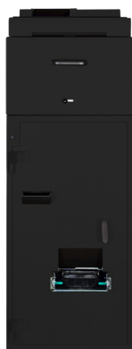
C2000 Coin Recycler