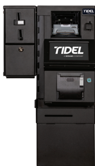
Tidel D3 Single Note Feed Single Coin Acceptor