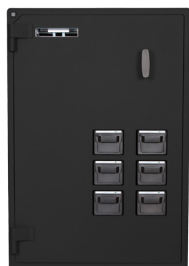
Bulk Coin and Note Dispenser